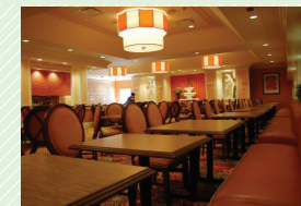
Roman Gardens Cafe