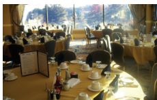
Main Dining Room